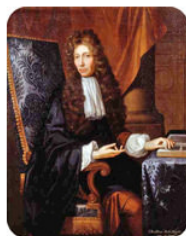
Figure 1.7.3: Robert Boyle.

Major progress was made toward putting chemistry on a solid foundation when Robert Boyle (1637-1691) began his research in chemistry (Figure 1.7.3). He developed the basic ideas about the behavior of gases. He could then describe gases mathematically. Boyle also helped form the idea that small particles could combine to form molecules. Many years later, John Dalton used these ideas to develop the atomic theory.