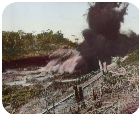
Figure 1.7.5: Dynamite explosion in Panama, Central America (1908).

Charles Goodyear (1800-1860) discovered the process of vulcanization, allowing a stable rubber product to be produced for the tires of all the vehicles we have today. Louis Pasteur (1822-1895) pioneered the use of heat sterilization to eliminate unwanted microorganisms in wine and milk. Alfred Nobel (1833-1896) invented dynamite (Figure 1.7.5). After his death, the fortune he made from this product was used to fund the Nobel Prizes in science and the humanities. J.W. Hyatt (1837-1920) developed the first plastic. Leo Baekeland (1863-1944) developed the first synthetic resin, widely used for inexpensive and sturdy dinnerware.