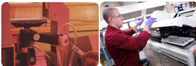
Figure 1.7.2: (left) Measurement of trace metals using atomic spectroscopy. (right) Measurement of hormone concentrations.

In practice, chemical research is often not limited to just one of the five major disciplines. A particular chemist may use biochemistry to isolate a particular chemical found in the human body such as hemoglobin, the oxygen carrying component of red